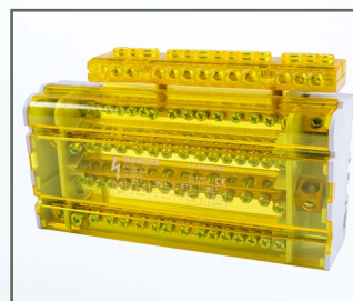
Usage of Neutral Bar